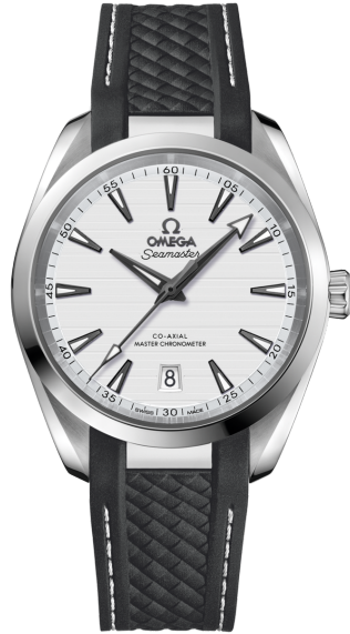
Seamaster AQUA TERRA 150M