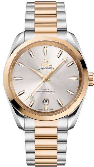
Seamaster AQUA TERRA SHADES