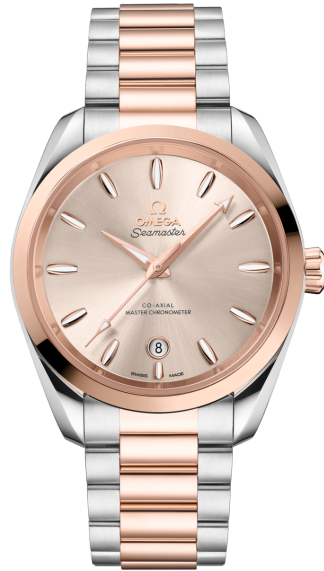
Seamaster AQUA TERRA SHADES