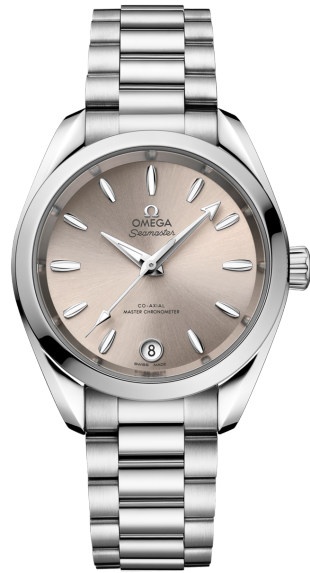
Seamaster AQUA TERRA SHADES