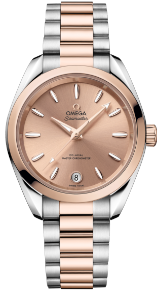
Seamaster AQUA TERRA SHADES