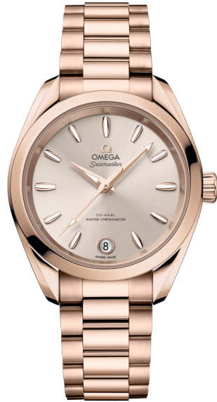
Seamaster AQUA TERRA SHADES