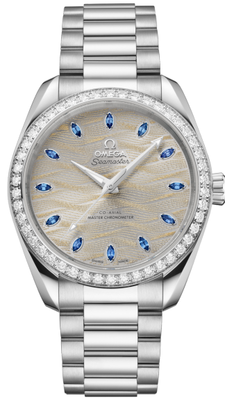
Seamaster AQUA TERRA 150M