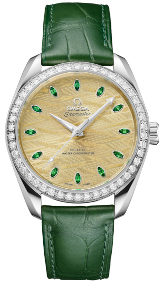
Seamaster AQUA TERRA 150M